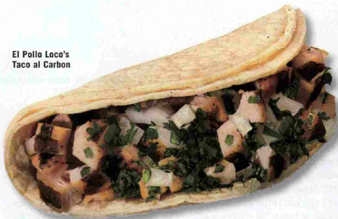
El Pollo Loco's Taco al Carbon