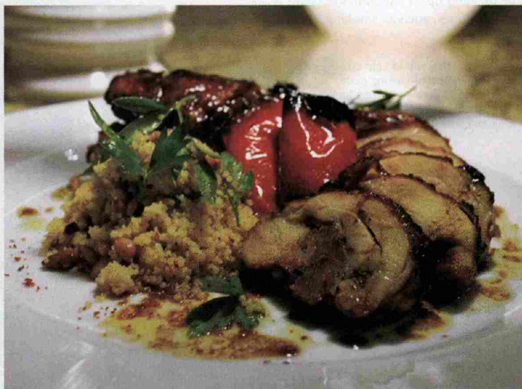
A sophisticated presentation helps sell stuffed chicken thighs at Westbury, N.Y.'s City Cellar Wine Bar and Grill.

Still, those who are champions for dark meat acknowledge that the protein may have a bit of an image problem. Though they don't necessarily hide the fact that a recipe contains thigh meat, many operators don't call it out,