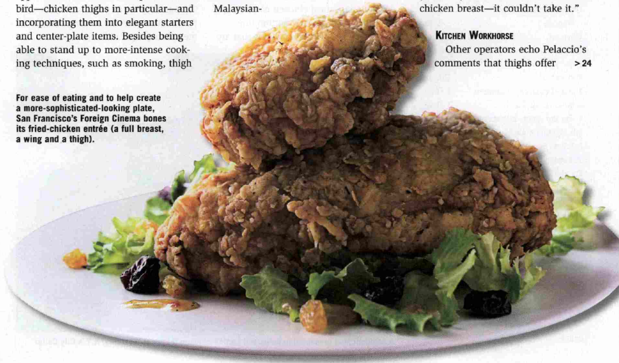
For ease of eating and to help create a more-sophisticated-looking plate, San Francisco's Foreign Cinema bones its fried-chicken entrée (a full breast, a wing and a thigh).

Other operators echo Pelaccio's comments that thighs offer > 24